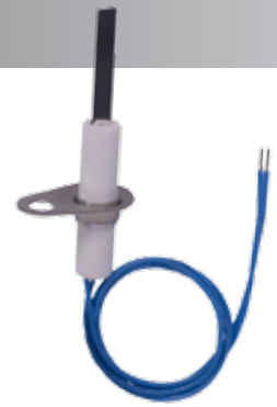
HotRod Ex 21D64-44 14.5" Leads-stripped ends. Replaces more than 200 HSI Ignitor Applications