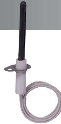
HotRod 21D64-2 15.5" Leads-stripped ends. Replaces more than 150 HSI Ignitor Applications

Packaged in see-through, protective blister card 21D64-2 is available in convenient Truck Stock 5-pack as 21D64-5PK